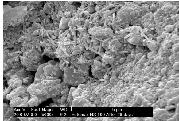
Treated 28 days